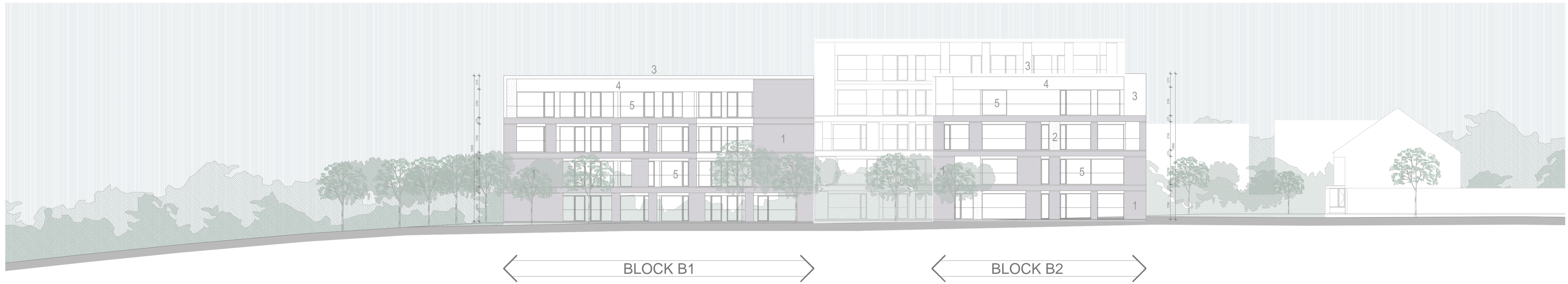
BLOCK B1,B2 & B3 - M1 ELEVATION SCALE 1:200@A1