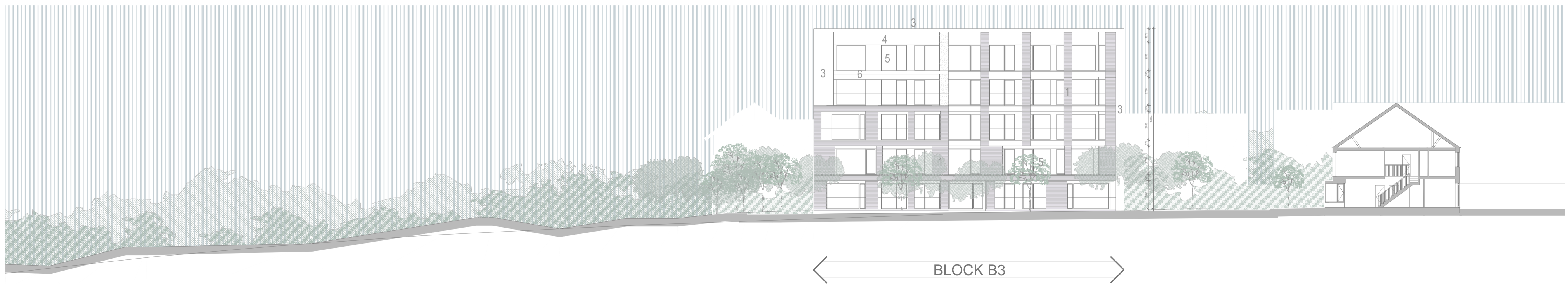
BLOCK B1,B2 & B3 - SECTION DD SCALE 1:200@A1